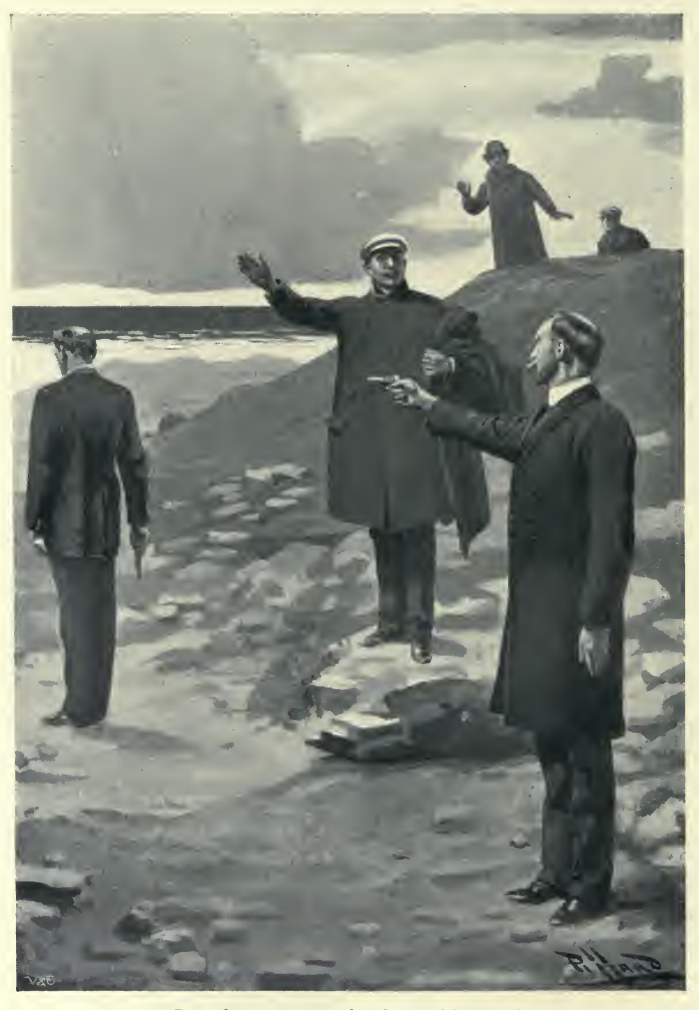
"' Put down your pistols,' said Nikola."